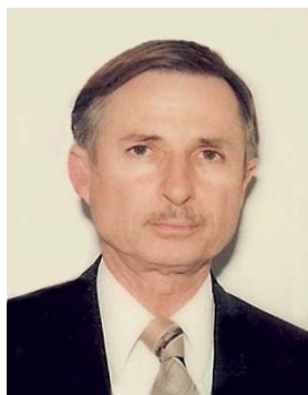
Board of Forensic Toxicol-