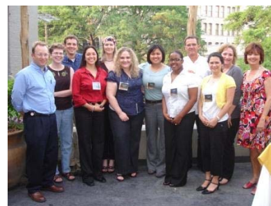
Members (and a couple of spouses) of S.A.T. from Bexar County MEO, May 2009